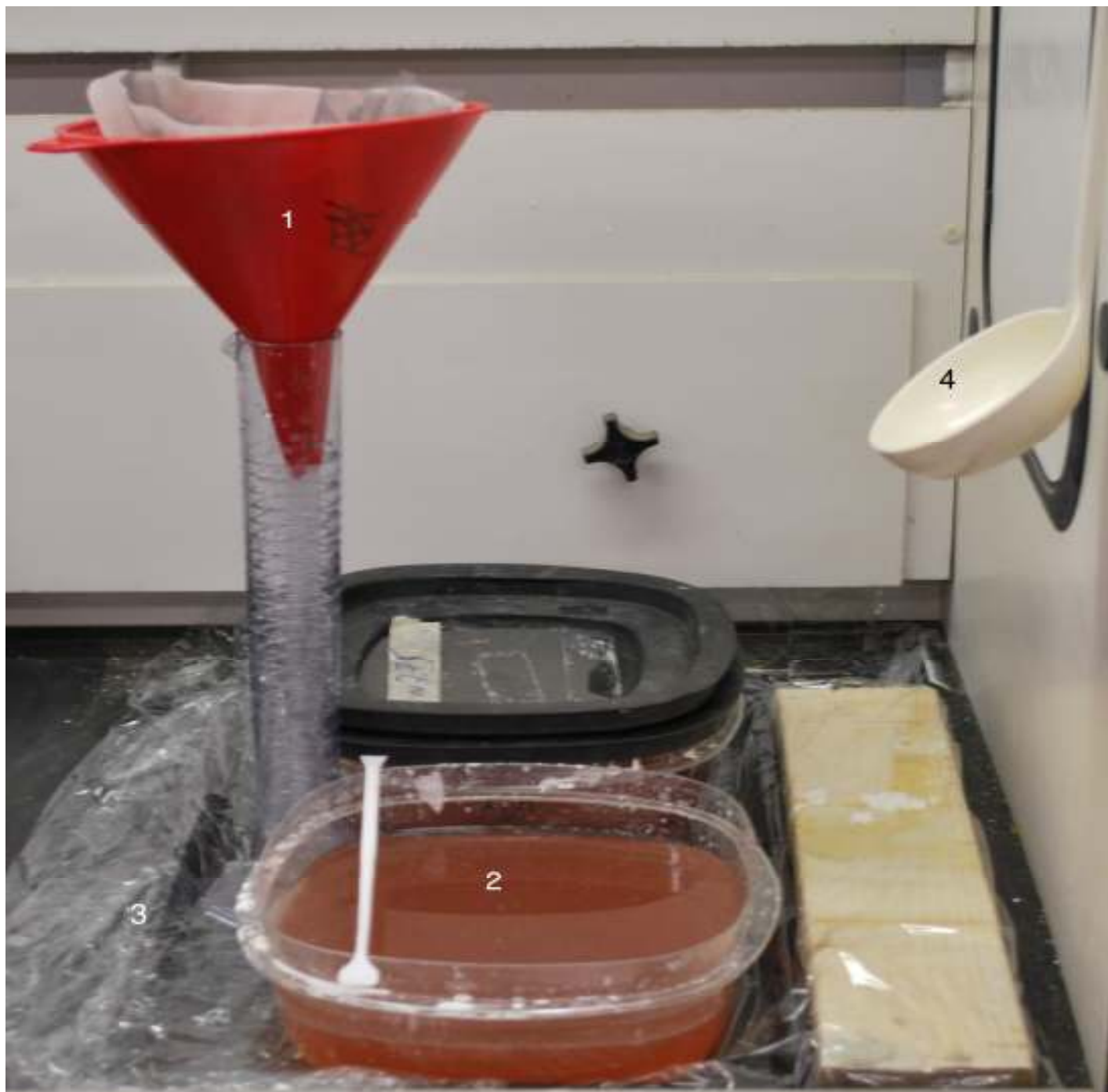
Figure 1. An example of a small SPT processing station. Note that this is highly reduced to emphasize the main components: the large funnel with nested filters and nets (1), the deep container (2) with clay-tinted SPT, the plastic covering over the basal tray holding the rest of the equipment (3), and the plastic ladle (4). In standard use there would be several graduated cylinders and multiple SPT-filled containers with nets in place, as well as a hydrometer (easily stored in a graduated cylinder of DI water).

bones, then the teeth, for instance). Should an unacceptable amount of fossils float, lower the density, should too much sediment sink, raise the density. This allows for easy assessment of the SPT and quick recovery of the fossils and sediment when the assessment is complete.