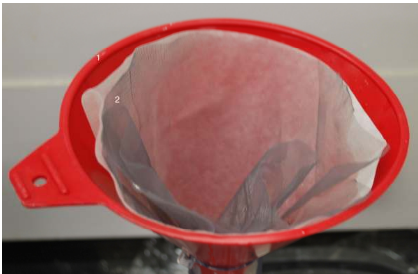
Figure 3. A close-up of the funnel apparatus with the outer plastic funnel (1) and inner mesh net (2).

vary and we suggest experimenting with the solution to determine optimum time). After the "heavies" have settled, use the plastic ladle to skim off (remove) as much of the floating sediment as possible (and, with each ladle, try to leave as much SPT in the container as possible). Ladles with spouts are recommended, because they can be gently immersed so that the sediment flows into the ladle through the spout, allowing for most of the SPT to remain in the container. This is desirable to avoid disturbing the "heavies" if the SPT in the container gets too low and thus accidentally ladle them out (this is also why deep containers are preferred).